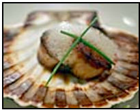
LaBan review: Cafe Apamate