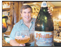
Philly taps legacy, brews up beer fest