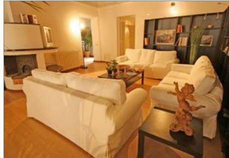
The Rental in Rome Web site shows apartments available in the city as alternatives to hotels.

When we were in Ireland, we stumbled on the Ballyvara House ( www.ballyvarahouse.ie ) in Doolin, County Clare, en route to the Cliffs of Moher. The hotel is a beautiful place to stay, with exquisite views of the sea and shore. And it offers so much more: the nearby cliffs; the Burren, a wild and unforgettably rocky place; inns with Irish music; and a