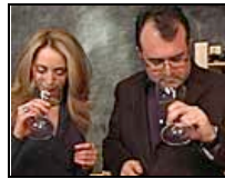
Philly Uncorked: Austrian whites